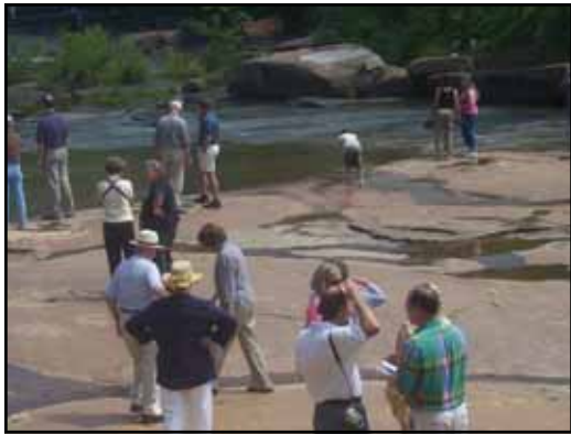
Supporters mingle and discuss LandTrust projects at the annual meeting at the RiverPark at Cooleemee Falls.