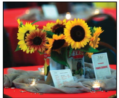
Local sunflowers brightened tables.

which will enable The LandTrust to continue land protection efforts at the confluence of the Yadkin and South Yadkin Rivers.