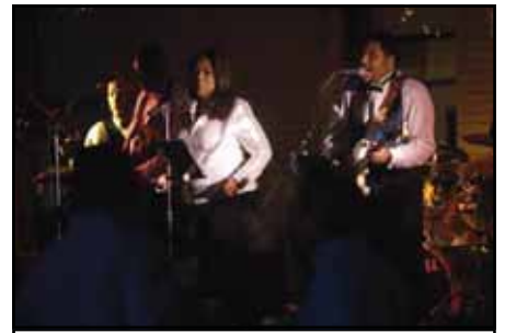
The Risse Band provided attendees with music for the evening.

which will enable The LandTrust to continue land protection efforts at the confluence of the Yadkin and South Yadkin Rivers.