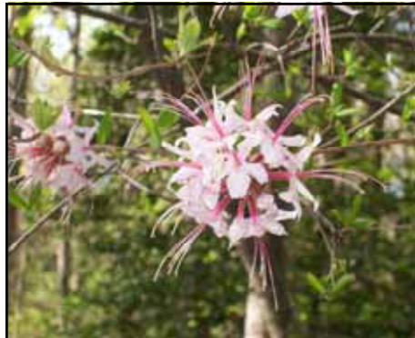
Wild azalea bloom on the recently protected Birkhead Property