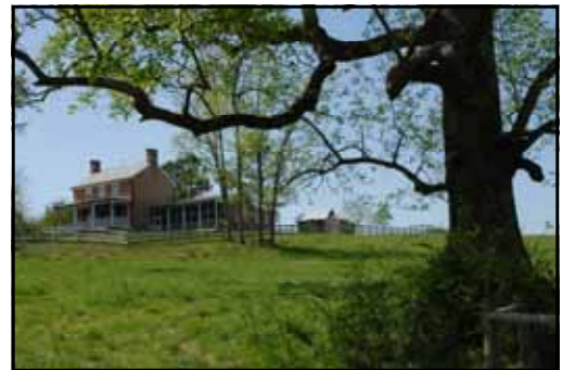
Historic Wood Grove House