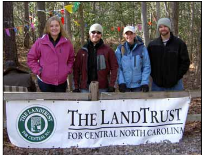
LandTrust Staff volunteer at the 20 mile finish line.