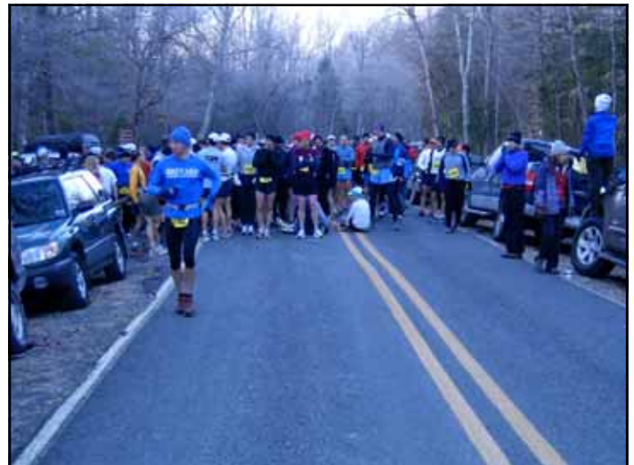
As the sun comes up, participants eagerly await the start.