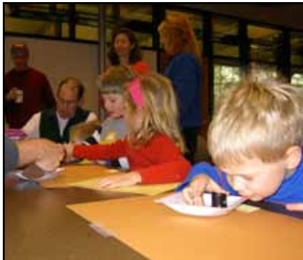
Attendees explore nature at environmental education event