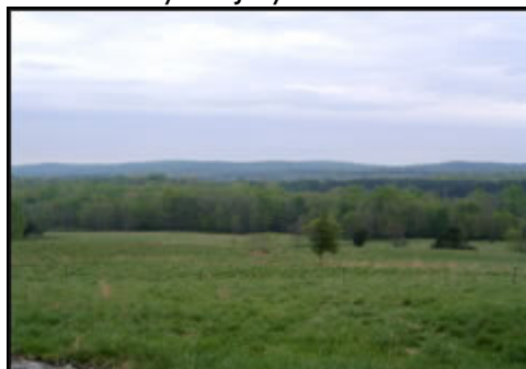
Scenic view of the Uwharrie Mountains as seen from the newly protected property.

located in a strong farming community that goes by the name of Farmer. “We’re very pleased to be able to protect a farm with so many conservation benefits” says Kevin Redding. “From the agriculture to