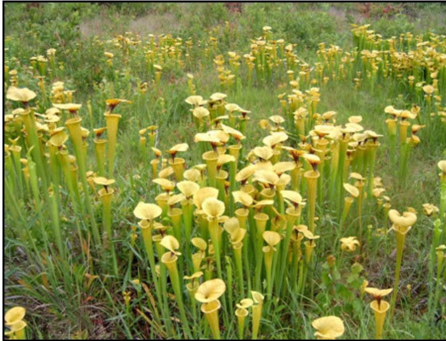
Photo of Sarracenia flava , yellow pitcher plant, taken in Richmond County, NC. Pitcher plants occur along an ecologically important corridor of the Pee Dee River. The LandTrust is partnering with several state and local agencies in an attempt to protect these significant natural communities.